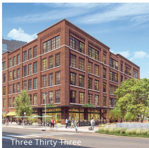
Three Thirty Three